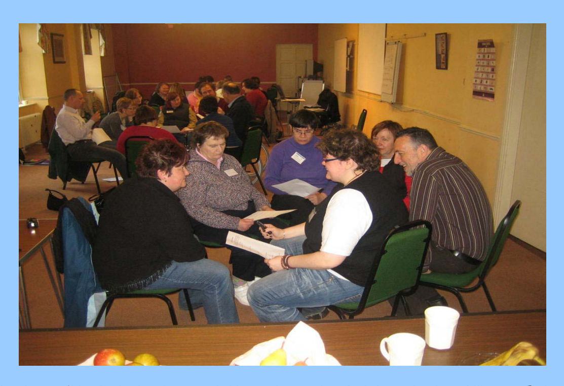
Members of the Inclusive Research Network practice their interviewing skills at a Galway workshop held in November 2008.